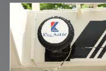
SLI – Safe Load Indicator

Rate loads are calculated for operation on leveled surface.